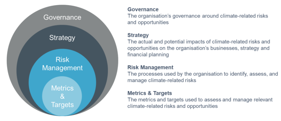
Figure: Core elements of recommended climate-related financial disclosures.

Within these sections, there are a total of eleven recommended disclosures with additional guidance for insurers, asset owners, and asset managers separately.