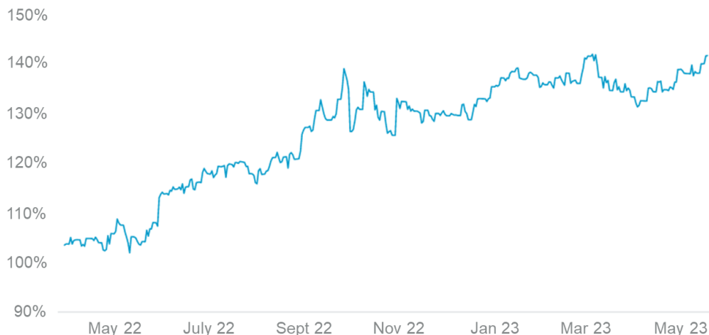
Sample LGPS fund funding level progression

Given all this, it's not surprising that funding levels have changed over this period. But it may be surprising that the direction of travel has been upwards (especially with a 10.1% benefit increase in April 2023).